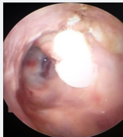
Figure 1: Showing whitish mass in the posterior canal wall.

All the patients underwent examination under microscope. In all the patients, mass was excised and external auditory canal cholesteatoma was diagnosed on histopathology (Figures 1 & 2). In 30 patients, lesion was small and mastoid air cells were not involved (Figure 3). For these patients canaloplasty was done. 5 patients had a small posterior wall defect without involving the middle ear cavity. For these patients, canal-wall up mastoidectomy and canal wall reconstruction was done. One patient had a large posterior wall defect with involvement of the middle ear cavity and in this case, canal-wall down mastoidectomy was done. Postoperative period was uneventful. All the patients were followed up for one year and there was no recurrence.