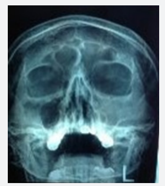
Figure 1: Diffusely shadowed left maxillary sinus.

Today's trends suggest FESS (Functional Endoscopic Sinus Surgery) which requires hospital treatment and demands special and costly equipment, strictly defined indications and the adequate training of the physicians for its performing. Nevertheless, the rating of other surgical procedures, such as the "antral window" procedure, is in downfall because of the FESS. Prior to any intervention, one must determine the size and the content of the sinus. For that purpose, we can use methods such as CT, NMR or even a regular RTG of the paranasal cavities can come to use. Occasionally, a clinical check up with the anamnestic data and an RTG of the paranasal cavities is enough to make a diagnosis.