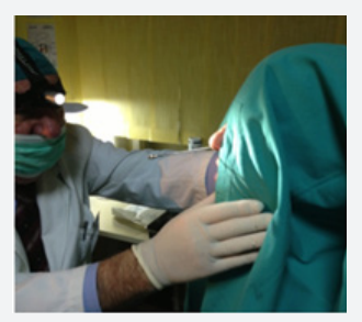
Figure 6: A needle in the right maxillary sinus.