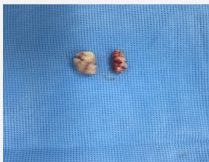
Figure 4. Post-excision specimen.