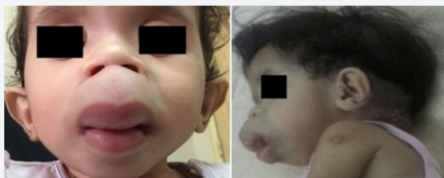
Figure 1. Gross anatomical presentation: Frontal view (a) and (b) lateral view.

and was discharged one week later in a good condition (Figure 4). Histopathological examination of the excised nodule at the upper lip revealed an abundance of homogeneous, amorphous, eosinophilic extracellular matrix that contained spindle-shaped cells. Histochemically, the homogeneous matrix of the lesion area was PAS-positive, while the Congo red stain was negative. Based on testing for the ANTXR2 gene and histopathological findings, a diagnosis of JHF was made.