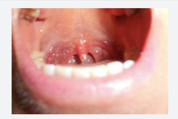
Figure 4: Three days post-Uvuloplasty using BAE RF Electrodes.

Another advantage is that a pressure-less incision can be performed with ease, even in deep and difficult to reach areas of tissues. The electrodes are reusable, and may be kept in cold sterilization solution when not in use. Use of radiofrequency in