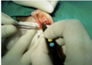
Figure 2: BAE RF Electrode in use for Otoplasty.