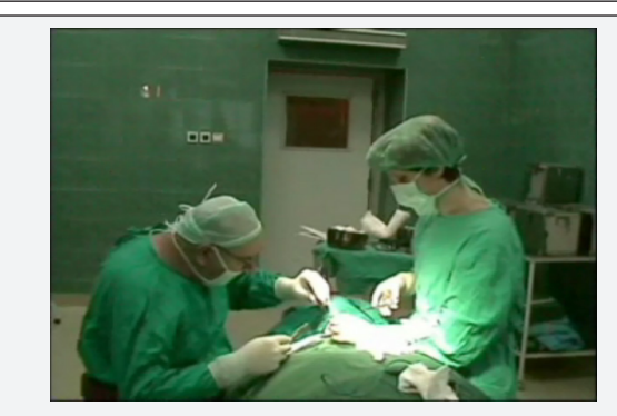
Figure 5: Completion of the operation by sewing the skin with the atraumatic suture.