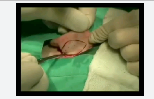
Figure 3: Excision of the skin with a classic cut.