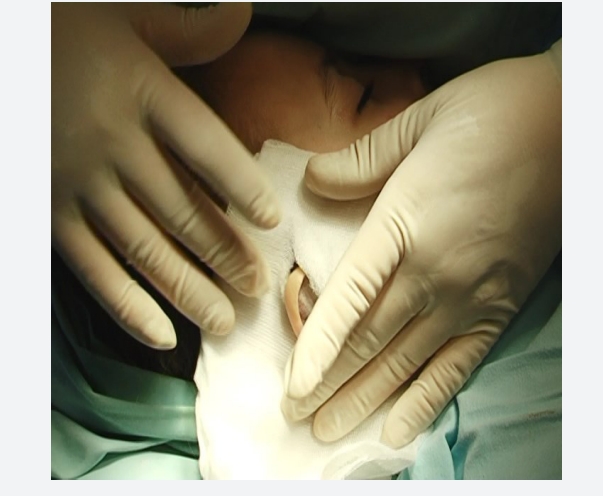
Figure 7: Bandaging post-surgery.

Bandaging is very important. First, the physiological depressions of the lateral side of the ears are filled with gauze tampons and antibacterial ointment, then a gauze (as shown in the picture) is placed retro-auricular and on the outside of the auricle. The outer side of the auricle is covered with cotton balls and over that, gauze is wrapped around the head. The next fixation is done on the second or third day. On the tenth day, the bandage is removed and at the same time the sutures are removed from the skin. It is advisable to wear tape around the ears and the head for another two to three weeks, especially during sleep.