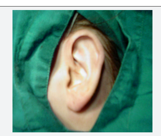
Figure 6: Appearance of the ear shell immediately after surgery where the anatomical structures and architecture of the auricle are preserved are completely preserved.