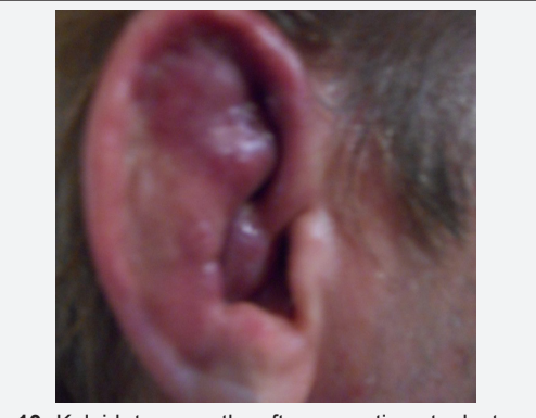
Figure 10: Keloid- two months after corrective otoplasty.

Postoperative complications following otoplasty may be early or late and lead to serious auricular deformities. Early are manifested in the form of hematoma, bleeding, skin infection, pericarditis, etc., and is delayed in the form of keloid scarring, granuloma, fistula, deformity of the ears and restoration of the auricle in the previous position, etc.