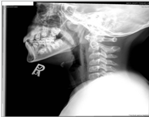
Figure 2: Lateral radiograph of the neck showing extensive free air in the retropharyngeal space.

He was admitted to the general ward for observation, started on analgesics and broad-spectrum antibiotic in a form