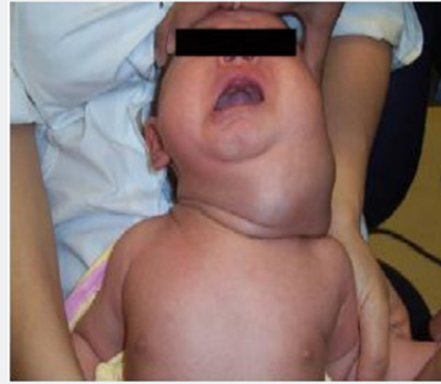
Figure 2: Infant with a large late ro cervical mass.

prevent iatrogenic damage during surgical excision and enhance prognosis (Figure 2).