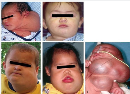
Figure 4: Head and neck lymphatic malformation stages. A, Stage 1, unilateral infrahyoid. B, Stage 2, unilateral suprahyoid. C, Stage 3, unilateral suprahyoid and infrahyoid. D, Stage 4, bilateral suprahyoid. E, Stage 5, bilateral suprahyoid and infrahyoid.

Although some authors have reported watchful waiting for lymphatic malformations this should be considered only in patients who are asymptomatic. Medical treatment of LMs consists of the administration of sclerosing agents, such as OK-432 (an inactive strain of group A Streptococcus pyogenes ), bleomycin, pure ethanol, bleomycin, sodium tetradecyl sulfate, and doxycycline. An infected LM should be treated with intravenous antibiotics, and definitive surgery should be performed once the infection has resolved (Figure 4).