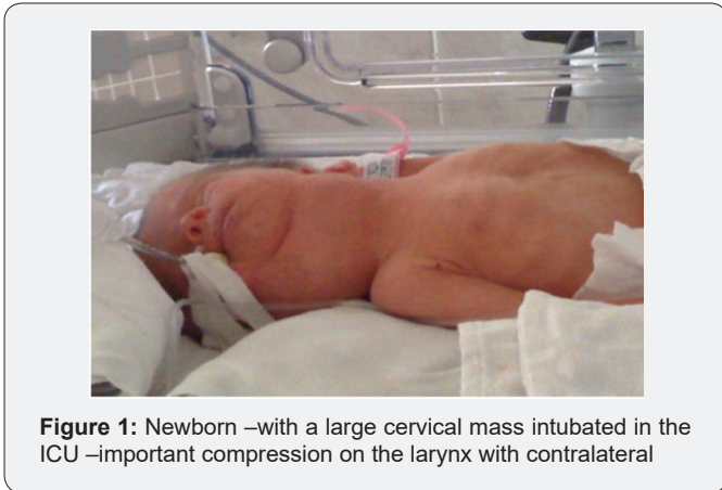
Figure 1: Newborn –with a large cervical mass intubated in the ICU –important compression on the larynx with contralateral