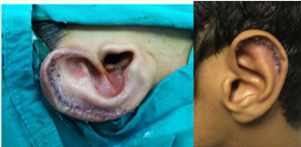
Figure 2: Excision of the skin wedge and Suturing the skin.