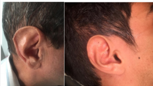
Figure 3: Preoperative.

Patients were followed up for six months. Results are very good. No intraoperative complications. No postoperative infection or perichondritis. No pain or auricular hematoma. All