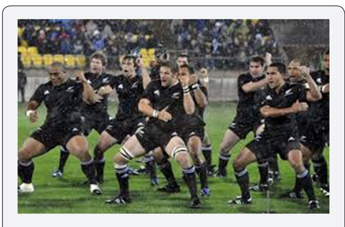
Figure 3: Muscular chant and gyrations in rugby team winning philosophy.