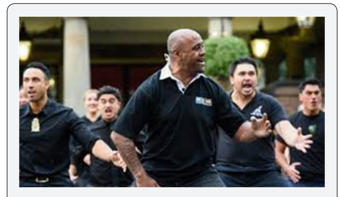
Figure 5: Joyous relief haka follow a game over celebration.