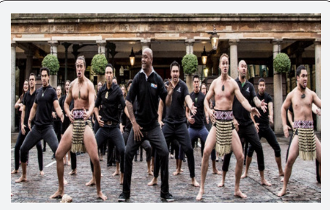
Figure 6: Celestial Haka thanks giving follow a rugby game win.