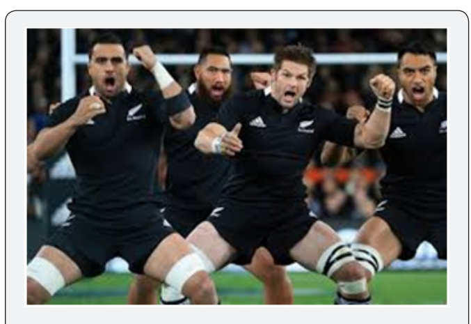
Figure 2: Chant and gyrations in complementary rugby action.