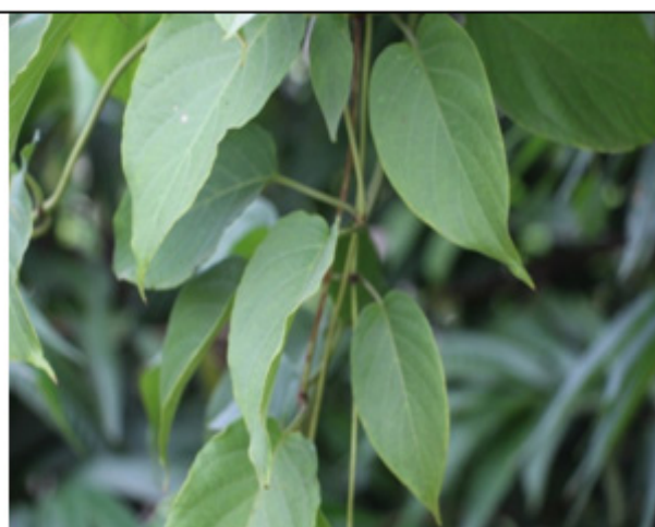
Paederia foetida Linn. : Mature Plant.