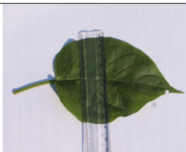
Paederia foetida Linn. : Leaf.