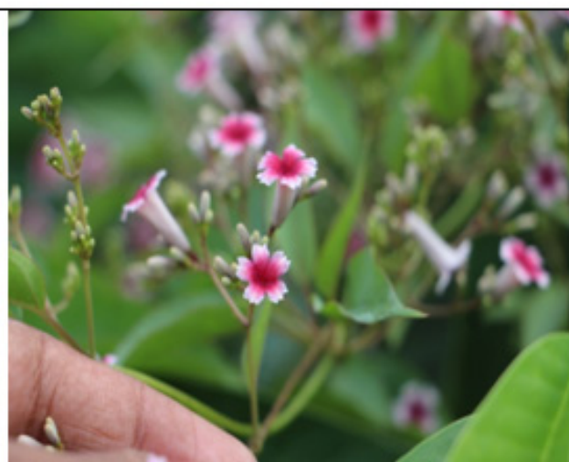
Paederia foetida Linn. : Flowering Stage.