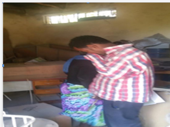
Figure 3: Storekeepers exposure to obsolete pesticide stockpiles.

accumulated in the study areas are likely to expose residents to hazardous health and environmental impacts if the current