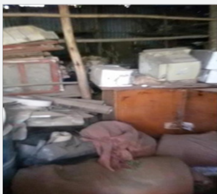
Figure 2: Obsolete Pesticides stored mixed with office utilities.