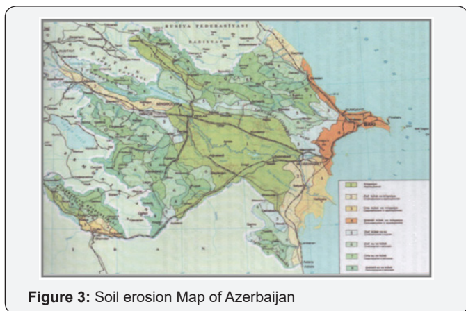
Figure 3: Soil erosion Map of Azerbaijan

more. The depth of local bases of erosion varies from a few meters to 1600 meters and more. In connection with strong rugged territory inclination range from 3-to 450 or more (steep and steep slopes) Vegetation, as Woody and herbaceous, soil and water conservation is of great importance. In the presence of dense vegetation cover accelerated soil erosion and flushing. Soil erosion studies in various parts of the Republic gave an opportunity to establish the development of erosion processes in individual areas and draw up a soil-erosion map of Azerbaijan. Plane wash soil are almost in all parts of the Republic, especially in the mountainous and Foothill areas. In the foothill zone has a broad development of gully erosion, and partly by the wind. Flush the soil on the Caucasus when steep slopes reaches for the year 50-300 t/ha. The growth rate of ravines in Azerbaijani territory in the mountainous area reaches 3-5 m, while in the foothill zone-5-10 m for the year. The mountain zone is characterized by the development of data of ravines (Figure 3).