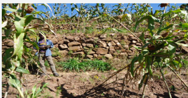
Figure 4: Stone bund implemented on farm land.

Additionally, the respondents estimate these changes in percentage based on their understanding. According, 66.7% of the respondents were estimated the change as moderate (25-50%) while 20.8% and 12.5% of them were estimated as good ( \geq 50\% ) and localized ( \leq 25\% ) respectively (Table 3). The respondents and also key informants related this change with increased in residual moisture content, decreased in soil erosion and hence protection of fertile top soil and Increased of ground water for supplemental irrigation due to contour bunding (level bunds), helping in crop growth and yield. These indicated that watershed management interventions in the study area provided significant change by reducing runoff and soil erosion, improving basin hydrology, maintaining and/or improving farmland soil fertility and thereby improving/maintaining agricultural production, reducing sediment load to natural and human-made reservoirs and reducing further degradation.