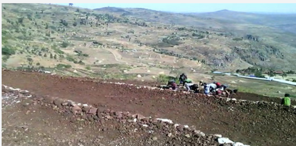
Figure 2: Stocking sorghum stalk for fuel wood and fodder.

Additionally, 27.03%, 90.8%, 19.58%, 1.7%, of them were implemented crop rotation, intercropping, mulching and fallowing on their farm land consecutively. As compared to their level awareness, the most awarded farmers were implemented these conservation measures on their own farm land. This indicated that the more they aware, the better they implement watershed management practice on their farm land. In line with this, [10] suggests that an increase in knowledge/awareness, attitudes and skills of soil conservation increase farmers' participation in the implementation of conservation watershed management. [11] also found a significant and positive correlation between farmers' awareness and participation in implementation of watershed management operations.