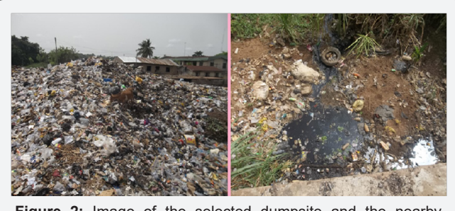
Figure 2: Image of the selected dumpsite and the nearby leachates.

Most of these residential buildings have no sewage disposal system; hence human waste and feces are deposited on this dumpsite alongside other industrial waste being carried from different parts of the town to be disposed at this particular dumpsite. Most of the hands dug well in this area are neither lined nor had a properly constructed base or cover. Some are simply covered with planks and rusted metal sheets as shown in Figure 3.