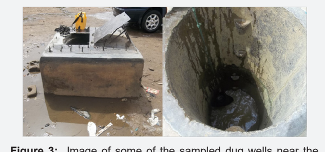
Figure 3: Image of some of the sampled dug wells near the dumpsite

Most of these residential buildings have no sewage disposal system; hence human waste and feces are deposited on this dumpsite alongside other industrial waste being carried from different parts of the town to be disposed at this particular dumpsite. Most of the hands dug well in this area are neither lined nor had a properly constructed base or cover. Some are simply covered with planks and rusted metal sheets as shown in Figure 3.