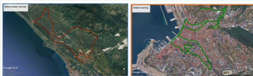
Figure 1: The extra-urban (on the left) and urban (on the right) surveys superimposed on the Google Maps satellite images.

The kinematic tests were carried out in the Karst plateau over Trieste municipality at a mean altitude of 375m above sea level, Italy and along a path inside Trieste urban area. The researchers drove the MMS vehicle at constant speed along different paths in urban and extra-urban contexts. The urban areas were chosen in order to analyze the Galileo performances also under sever satellite visibility conditions (Figure 1).