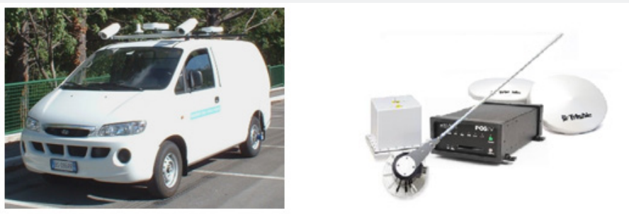
Figure 2: The MMS of the GeoSNav Lab, University of Trieste, and the Applanix Corporation POS LV© system components mounted on board the vehicle.

For the absolute positioning, the Mobile Mapping System uses the POS LV System of Applanix Corporation, a fully integrated, position and orientation system, using GNSS positioning integrated by inertial technology to generate stable, reliable and repeatable positioning solutions for land-based vehicle applications (Figure 2). Designed to operate under the most difficult GNSS conditions