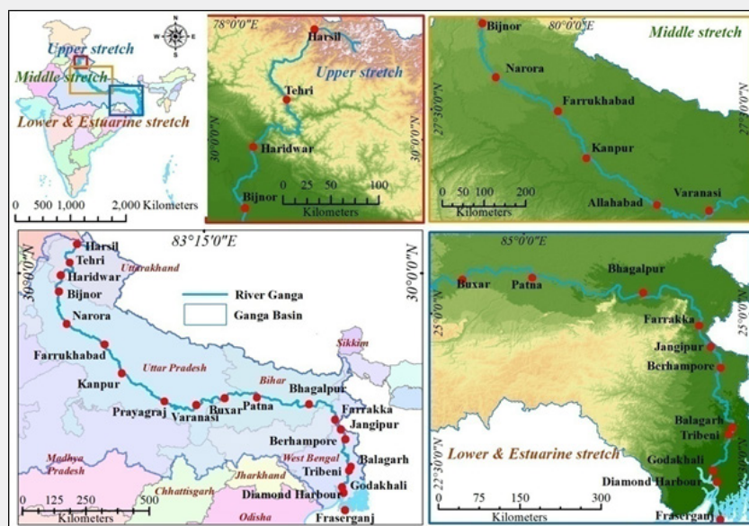
Figure 1: Study area along river Ganga through GIS mapping.

along the river. The sampling stations were divided into the upper zone (Harshil to Farukhabad), middle zone (Kanpur to Farakka), lower zone (Jangipur to Tribeni) and estuarine zone (Godakhali to Fraserganj). The bottom substratum of the sites varies from one zone to the other. The upper zone mostly comprises of rocky river bed while the middle part is comprised of clay bottom and the lower part is mostly composed of silt, clay and sand.