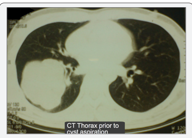
Figure 2: CT THORAX revealing a cystic lesion in right lung