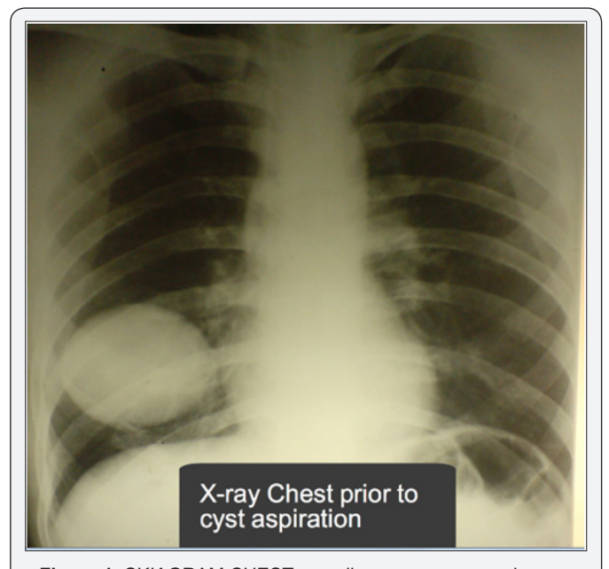
Figure 1: SKIAGRAM CHEST revealing a space-occupying lesion in lower zone of right hemi thorax.

and fragments of cyst wall resembling Echinococcus granulosus. Further serology was carried out to confirm the diagnosis. Antibodies to Echinococcus were significantly positive (1:18) by indirect haemagglutination test (IHA). Patient was ultimately started on high dose of oral albendazole therapy. Patient has clinicoradiologically (Figure 4) improved as on albendazole therapy and is presently asymptomatic.