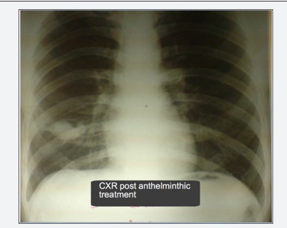
Figure 4: SKIAGRAM CHEST after albendazole chemotherapy.