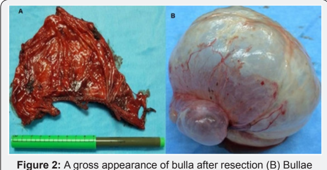
Figure 2: A gross appearance of bulla after resection (B) Bullaci inflated with air to demonstrate its size.

A 52 years old man smoker 40/cigarettes per day was admitted with shortness of breath on exertion, no history of cough, loss of weight and appetite. His chest X-ray showed a large bulla in left hemi thorax. Computed tomographic scan (CT) of thorax revealed giant bullae largely occupying the left hemi thorax (Figure 1). Routine blood investigations total white cell count, hemoglobin, renal and liver panels were normal. Preoperative FEV1 was 70%. At room air his oxygen saturation was 92%. Arterial blood gas analysis showed pH: 7.37, a PO2 (partial pressure of oxygen) was 65.2mmHg and PCO<sub>2</sub> (partial pressure of carbon dioxide) was 50.18mmHg. As the patient was symptomatic we decided to proceed for bullectomy. Prior to induction of general anesthesia an emergency surgical instruments trolley was prepared in case of any inadvertent event.