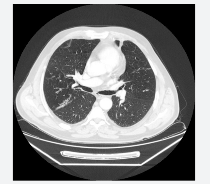
Figure 3: CT scan showing an increase in the diameter of both main bronchi.