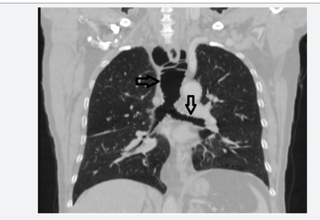
Figure 4: CT image reconstruction confirming Mounier Kuhn's syndrome.

Bronchial fibroscopy demonstrated an inflammatory aspect of the mucosa with tracheomalacia and tracheal diverticulum (Figure 5). Spirometry was suggestive of obstructive abnormality with poor bronchodilator reversibility, Alpha-1 antitrypsin was 255mg/dL (100-300mg/dL), nasal endoscopy did not reveal any polyposis and the spermogram was not performed (patient,