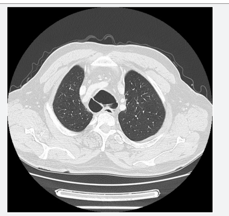
Figure 2: CT scan showing tracheal dilatation.

Blood tests found a CRP at 75mg/l, white blood cells at 12,500/mm<sup>3</sup> predominantly of neutrophils at full blood count. Thoracic computed tomography was conducted (Figures 2-4) and revealed tracheal dilation with a diameter of 35mm (whereas the normal diameter should not exceed 25mm in humans), and dilation of main stem bronchi with a diameter of 25mm on the right and 26mm on the left.