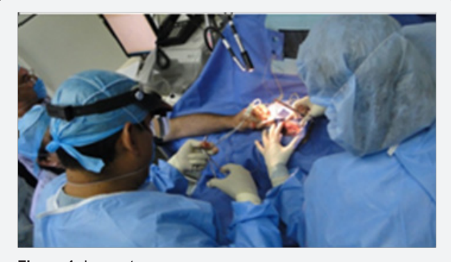
Figure 1: Laparotomy.

Medicine of Universidad Panamericana in Mexico City in 2010, NOTUS technique at the Pisanty Clinic at the ISSSTE in 2011 and in 2017 we began with conventional laparoscopic surgery and smart phones as laparoscope (Figure 1-4).