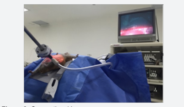
Figure 2: Conventional Laparoscopy.