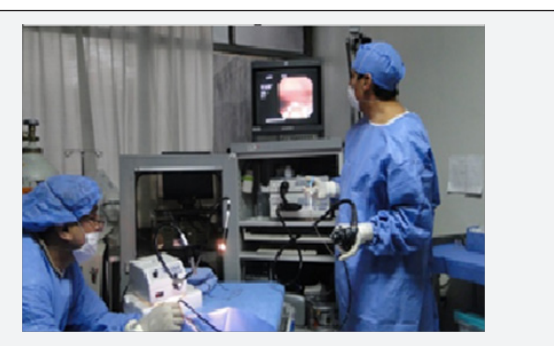
Figure 3: Natural Orifice Trans-sumbilical Surgery "NOTUS".