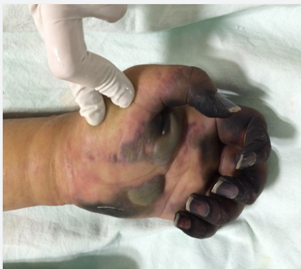
Figure 1: Gangrene of upperlimb upto wrist.

Tropical fever work up was negative. Based on the clinical picture with lab evidence of positive cryoglobulins and association of HCV, we made the diagnosis of HCV related mixed cryoglobulinemia with organ involvement in the form of glomerulonephritis, vasculitis in the form of purpura and symmetric peripheral gangrene of limbs. Initially he was started on pulse therapy of methyl prednisolone for 3 days and then tapered gradually. He was also started on therapeutic plasma exchange for 3 cycles. Over the period of therapy he developed wet gangrenous changes and taken for bilateral above knee amputation. Following the surgery he was continued with plasma exchange along with broad spectrum antibiotics. Despite of best possible efforts he could not be salvaged due to severe worsening septic shock with multi organ dysfunction. (Figures 1-3).