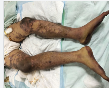
Figure 2: Extensive purpura of lower limbs.