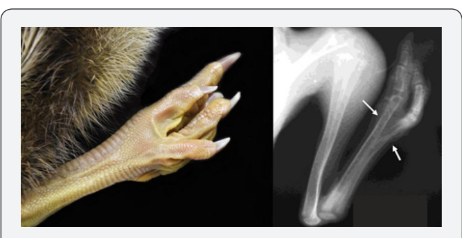
Figure 2: Right foot of greater rhea chick with polydactilyly (A). Radiographic image of the right foot showing the tarsometartasus duplication (B).