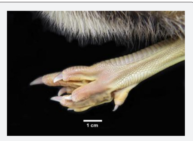
Figure 1: Lateral view of the left foot of greater rhea chick with polydactilyly.

of tarsal-metatarsal bones partially duplicate and the presence of six fingers in the right foot and seven in the left one (Figure 1). Radiographic image is presented in the Figure 2. Presence of the hallux in the left wing was observed. In the right wing, the specimen showed doubling of this finger (hallux) (Figure 3).