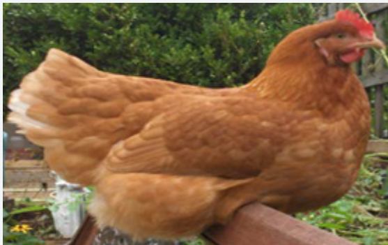
Figure 1: Bovans Brown

This breed was formerly known as Bovans Goldline and is a hybrid of Rhode Island Red (cock) and Light Sussex (hen). Bovans Brown is a brown feathered, brown egg layer which can meet the expectations of a variety of egg producers with different objectives (Figure 1). It is the bird of choice for today's egg farmers who expect high egg numbers and a forgiving bird essential ingredient to keeping business profitable. It not only performs well for the egg producer with traditional production