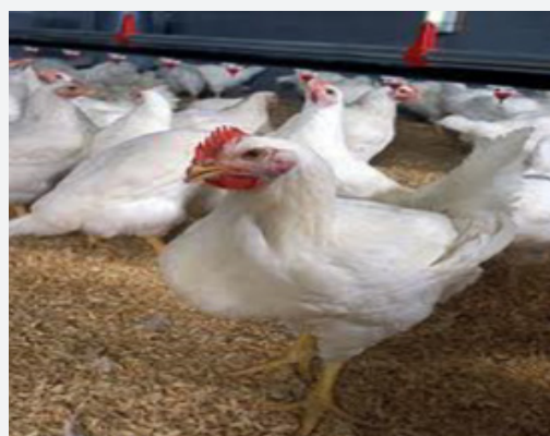
Figure 5: The map of regional poultry multiplication and distribution centers.

Ambo, Legatafo, Adelle, Bedelle, Nekemt (Oromiya), Awassa (SNNPR), Dire Dawa and Harar that mainly focus on Rhode Island Red breed (Figure 5).