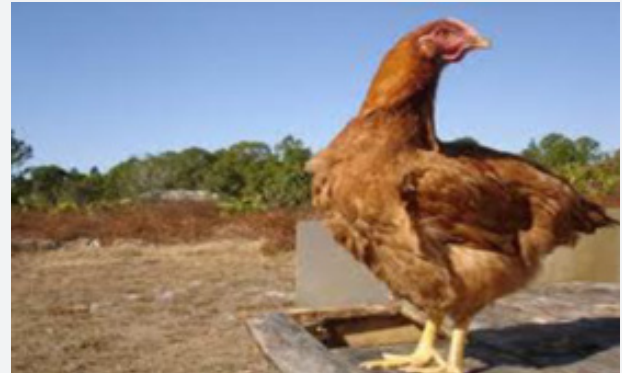
Figure 2: Issa Brown.

Like Bovans Brown, Issa Brown is also available in Ethiopia. This layer is a hybrid of Rhode Island Red (hen) and Rhode Island White (cock) (Figure 2). It is known for its high egg production of approximately 300 eggs per hen in the first year of lying. They are easy to rise and prolific producers of large richly colored brown eggs of excellent shell quality. They are quiet and friendly and easily trained to lay in their nest (Figure 2).