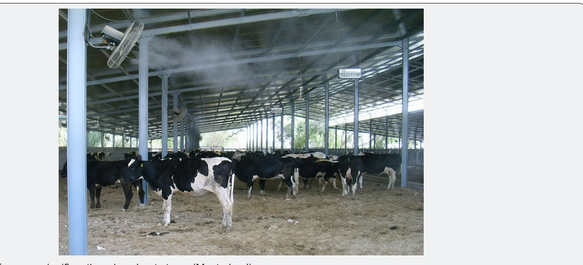
Figure 2: Misting fans can significantly reduce heat stress (Masterkool).