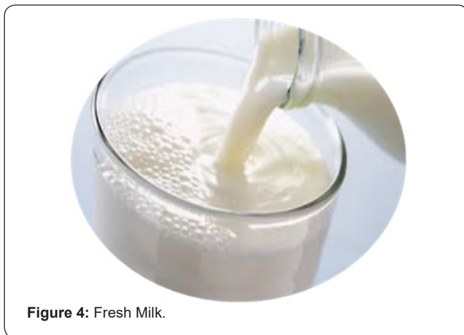
Figure 4: Fresh Milk.

Milk produced from udder of cow has different bacteria, some could cause disease or they are pathogenic, this disease