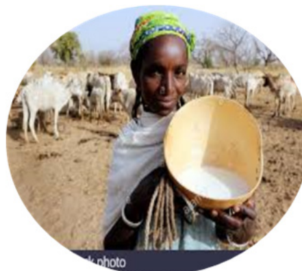
Figure 2: Hand Milking Nono.