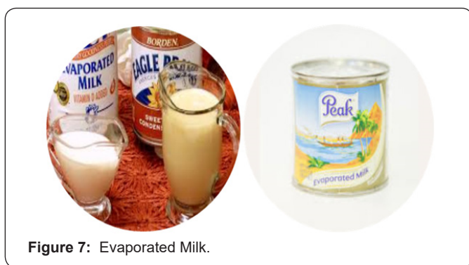
Figure 7: Evaporated Milk.

It is made by evaporating water from whole milk at 70.4°C - 73.2°C in a vacuum. About 50% of the water in the original milk is boiled off. This process can be achieved in the house by slowly evaporating water from milk in a pot, or the pot is placed in a water bath until the milk smells like evaporated milk popularly known as peak milk or carnation brand. Industrially, the concentrated milk is filled into tins and sterilized under pressure at 116°C for 15 minutes to kill all micro-organisms and in-activated enzymes as shown in Figure 7.