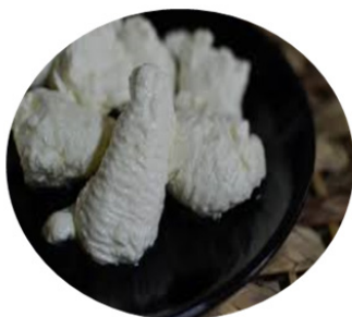
Figure 11: Cneese.

Cheese is the product made from the separated curd obtained by coagulating the caesin of milk, skimmed milk or milk enriched with cream. Curd is the coagulated part of milk or coagulum. The coagulation is accompanied by means of rennin or other suitable enzymes, lactic acid, fermentation or by the combination of the two. The curd may be modified by heat, pressure, ripening ferments, special mould or suitable seasonings. Cheese is a complex food product consisting mainly of casein, fat and water. The percentage of fat in cheese is influenced to the greatest degree by the percentage of fat in milk used for its production as shown in Figures 7-9.