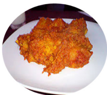
Figure 13: Cuisine.

There are several ways of making different kinds of cheese. Basically, there are two (2) common procedures required for most cheese making: Production of coagulum or curd and curing. A pure culture of specific bacteria is added to the milk to produce a desired acidity and flavor. A protein coagulant (rennin) is added to precipitate the protein which forms the body of the cheese. After precipitation of milk solids (cured formations), the liquid which remains is called whey. This is drained off and the curd is