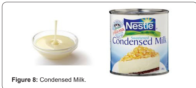
Figure 8: Condensed Milk.

The product is obtained by concentrating whole milk under a vacuum to concentration ranging from 2.5: 1 to 4:1. The usual ratio is 2.8:1. This means 2.8 volume of milk or its multiple is evaporated until one volume remains. About 18% sugar in the