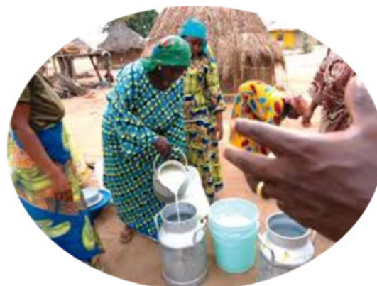
Figure 3: Coalition of Fresh Milk.