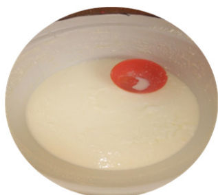
Figure 12: Fermented Milk (kindirmo).