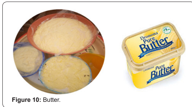
Figure 10: Butter.

When cream is agitated by churning, large chumps form to yield butter. This is because fat particles have mucin-like materials which are sticky; agitation causes large chumps to form. This chump of yellow fat form is called butter. A vessel in which cream is agitated is called the churn and churning is the process or the act of operating the churn. Cream is put into a churn where it is subjected to mechanical agitation. In a short time, yellowish granular appears, which is the first form of butter. The liquid is drained off and the granules are washed several times too with clean cold water. The granules are worked or kneaded into a solid mass which is called butter. During the kneading process, 1 - 2% salt is added by weight to enhance flavour of butter; the butter is then cut into rectangular shape and wrapped in water proof material and stored in a cool place. Butter contains about 80% fats, 16% water, 1% curd and 2.5% salt. The first liquid drained from butter after churning is called butter milk; in India butter oil is called Gee as shown in Figure 10.