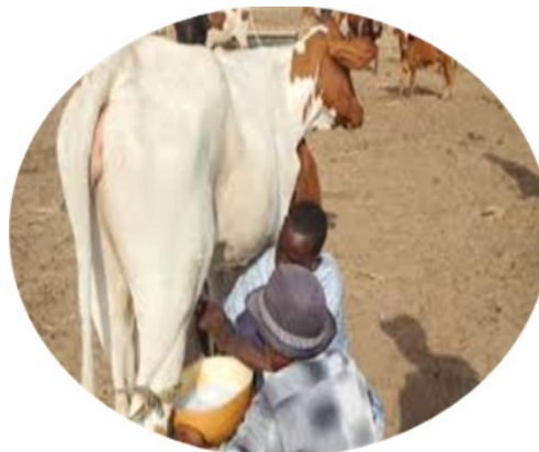
Figure 1: Hand Milking.

and custom. The local products are also much cheaper than their imported counterparts. Sour milk and local butter accounted for over 30% of all dairy products consumption. Urban household consume about 20% more dairy products than rural household. Pastoralists are mostly the producers but consume less of the products. The bulk of the milk produced by Pastoral Fulanis are sold to urban dwellers for exchange of money, grains and other life necessities [12].