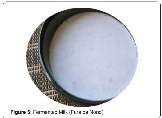
Figure 5: Fermented Milk (Fura da Nono).

could enter the milk through flies, contaminated water or utensils. The most obvious reason for processing is to safeguard the public health through parturition or sterilization of milk and milk products. This ensures elimination of disease-causing bacteria. Other reasons for processing are to get evaporated and condensed milk, this will reduce the cost of transportation because you have reduced the quantity of water. It also reduces storage spaces. Processing also produces cream which is used for ice cream. The milk protein, casein is processed into cheese of different varieties. Another reason for processing is to conform to industry and health regulations, for example, in countries where dairy products are inspected before they are sold, unprocessed dairy product will not be passed for sale if set safe standards are not met. Such standards require some degree of processing. Examples of dairy products are fresh milk, fermented milk, cheese, yoghurts and whey as shown in Figures 4 & 5 [12].