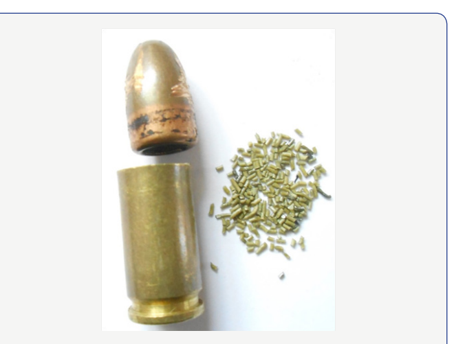
Figure 4: Propellant of a 9 mm standard ammunition.