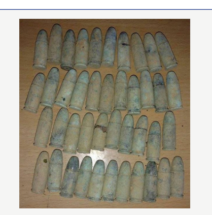
Figure 1: Recovered 9 mm dumped ammunition.

The recovered 9 mm pistol cartridges along with head stamp of one representative cartridge were photographed and shown in the Figures 1 & 2 respectively. The cartridges were soiled and oxidized. Out of the bulk four cartridges were randomly selected and initially cleaned by acetone followed with dilute hydrochloric acid to decipher the head stamp impressions. The parameters