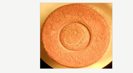
Figure 2: Head stamp of one representative 9 mm dumped ammunition.