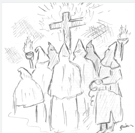
Figures 3 & 4: Turkey's political history is totally free of incidents like Nazi concentration camps or former Ku-Klux-Klan activities in the southern states of America (illustrations by the author).