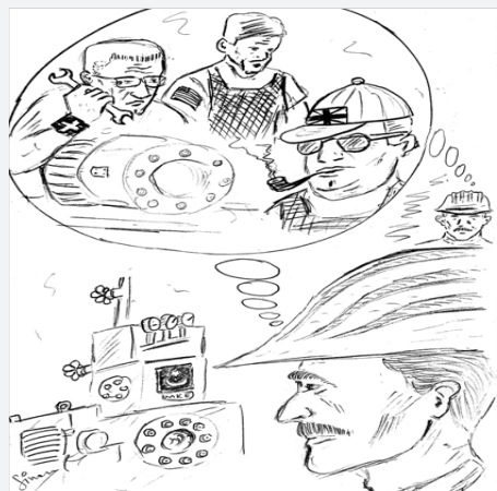
Figures 1 & 2: Let alone any xenophobia likes that of the radical skinheads in Germany, the Turkish population displays liking, admiration and respect towards foreigners. In a term-paper-research conducted at a mechanical plant in central Anatolia some years ago, it turned out that Turkish laborers had very positive attitudes towards western expatriate experts working with them.