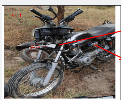
Pic. 1 shows the damaged motorcycle with dented number plate with red coloured letters painted on white painted base.

When paint fragments are able to be fit back into a source, those fragments may be identified as originating from that specific source. The crime laboratory determined the specific source by analysing vehicle paint samples. The chemical properties of paint are determined through the use of gas chromatography to determine whether samples are from the same source. Thus, paint can be used to establish the sequence of events in hit and run [7-9].