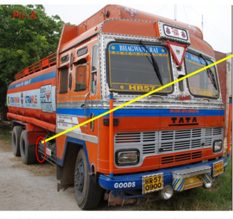
Pic. 4 show the truck that hit the motorcycle and escaped from the spot red and white coloured transfer of paint was detected in red encircled portion of the fuel tank.