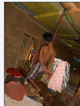
Figure 1: Partial hanging of the victim.