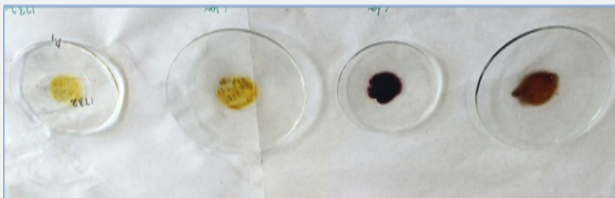
Figure 2: showing marquis test and frohde's test.