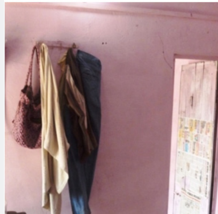
Figure 4(a): Recovery of two hand bags hung on one wall outside the room.