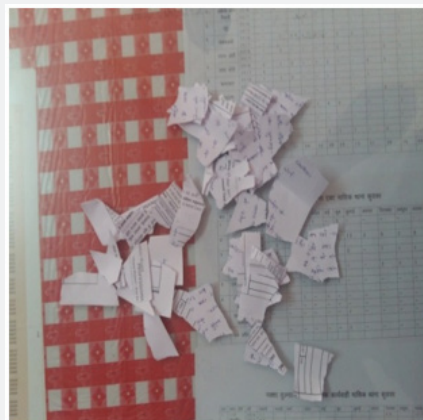
Figure 4(b): Fragments of irregularly shaped numerous mixed torn pieces of paper.