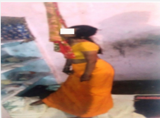
Figure 2(b): Photograph supplied by investigating officer before spot visit.

I. The inside door of crime scene room has lock hasp in the middle and the place where lock hasp enters the wall, the plaster of the wall was broken, broken pieces of wall plaster were scattered on the floor of the room which shows someone had forcefully opened the door and room was closed from inside during the incidence (Figure 3a).