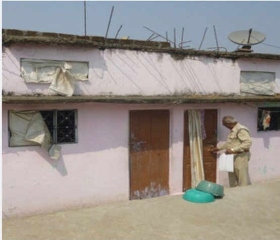
Figure 2(a): Rental house of the deceased where lady committed suicide by hanging.