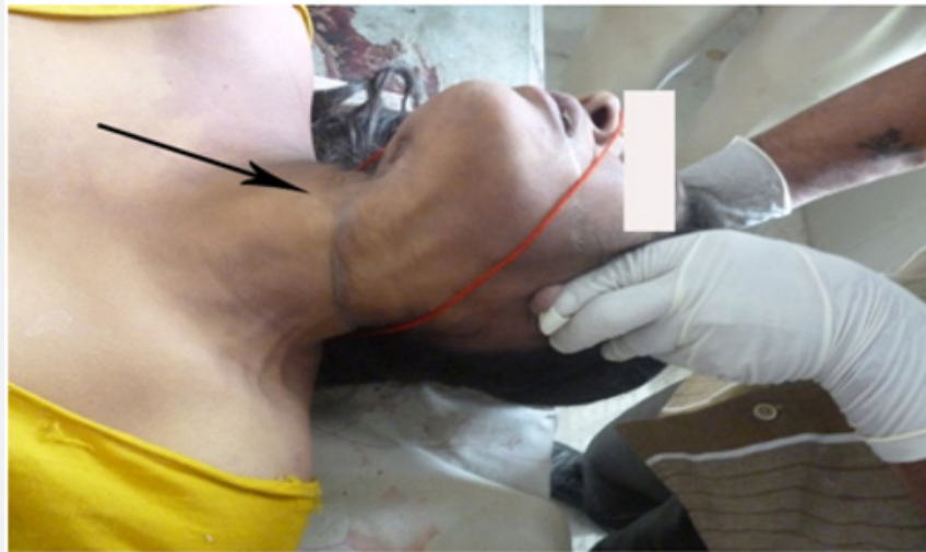
Figure 1(a): Non-Continuous Ligature mark above thyroid cartilage runs upward to right mastoid region.