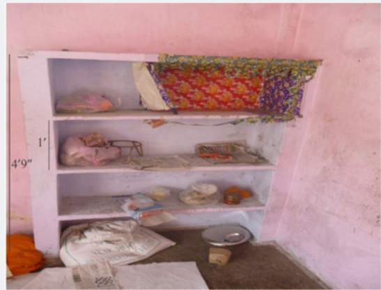
Figure 3 (b): Stone Shelf on the wall with three stone partitions.

II. Room was empty from inside except one carpet is placed on the floor. On one of the wall of the room there is stone shelf with three stone partitions (Figure 3b). at a distance of one foot, the height of the stone shelf from the floor is 4 feet 9 inch. Iron hook is there on the ceiling at a distance of 10 feet from the floor. No other relevant physical evidence were obtained from this room.