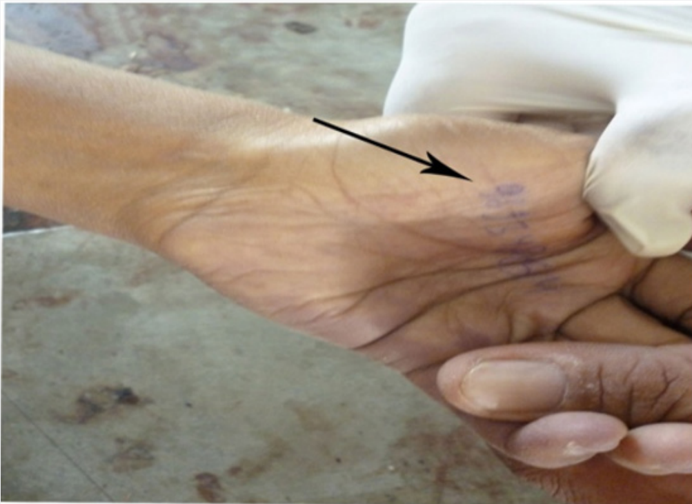
Figure 1(b): Mobile number written on the left palm of the hand.