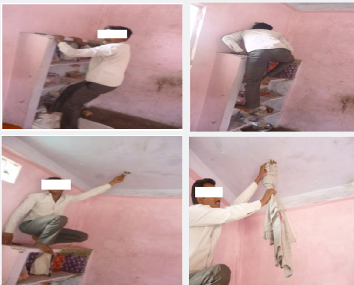
Figure 5: Reconstruction of the Scene.

ligature from the ceiling hook after the incidence, was made to stand on the upper base of the stone shelf (Figure 5). It was found conceivable to reach up to the ceiling hook and thus the re-enactment showed that hanging could indeed have been possible to be performed by the deceased lady by tying a knot around the neck from one end of the wearing apparel (sari) and other end to the ceiling hook. Reconstruction of Torn Document The reconstruction of a torn document with uneven edges is a puzzling, complex and challenging task to be performed by a human operator. In case of machine shredding of pages, each fragment piece of paper has straight edge only and hence the problem may be considered as a variety of jigsaw puzzle. But the reconstruction of torn document by hand is considerably different from the referred jigsaw problem [8,9].