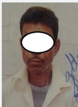
Figure 3: Offender, 57yr.