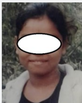
Figure 1: Victim girl, 12yr.