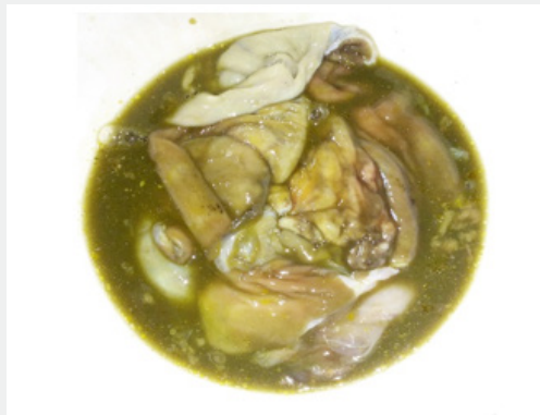
Figure 1: Part of stomach and intestine along with their contents.

The viscera of the deceased was received here were (i) part of stomach and intestine along with their contents (Figure 1) (ii) part of liver and kidney, Preservative (saturated sodium chloride solution) used. In general, the Forensic toxicologist rules out various poisons like metallic poisons (Arsenic, Antimony, Bismuth, Mercury, etc.), cyanide, yellow phosphorous, Zinc phosphide, Aluminium phosphide, pesticides (organophosphorous, organochlorinated, carbamate and pyrethroid compounds) and plant poisons (Nerium oleander, Cleistanthus collinus, Calotropis gigantea, Strychnos nux-vomica, Abrus precatorius, etc.). In this case all the above said poisons were ruled out, and also conducted chemical analysis for Melia dubia phytochemical constituents using the following methods.