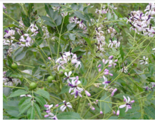
Figure 3: Melia azedarach .