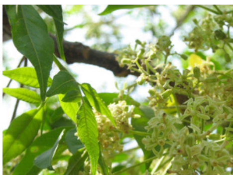
Figure 3: Melia dubia .

Melia dubia and Melia azedarach both species are from the same Meliaceae family. The identification of the species are complicated for the common people using the similar type of local names (Tamil language: Malai vembu & Kattu vembu). Major phytochemical constituents are different in both the species. According to this case she unknowingly consumed Melia azedarach leaf extract instead of Melia dubia , though both species have different morphology. Melia dubia leaves are compound with toothed leaflets, greenish-yellow flowers Figure 3 [18]. Melia azedarach leaves are twice-compound with oval to elliptical shaped leaflets, pink to lilac flowers Figure 4 [19]. Melia azedarach is a well-known ethnomedicinal tree used in Ayurveda. Its use in the traditional folk medicine is also well documented [20]. Though, Melia azedarach has many medicinal values, it becomes toxic if it is consumed in excess quantity. Toxicity study on rats and mice using Melia azedarach extract, higher concentration of the extracts depresses markedly the respiratory center by both routes, oral as well as parenteral. This may be due to the direct action on the respiratory centers. In doses where mortality was observed it was noted that death occurs due to the cessation of respiration.