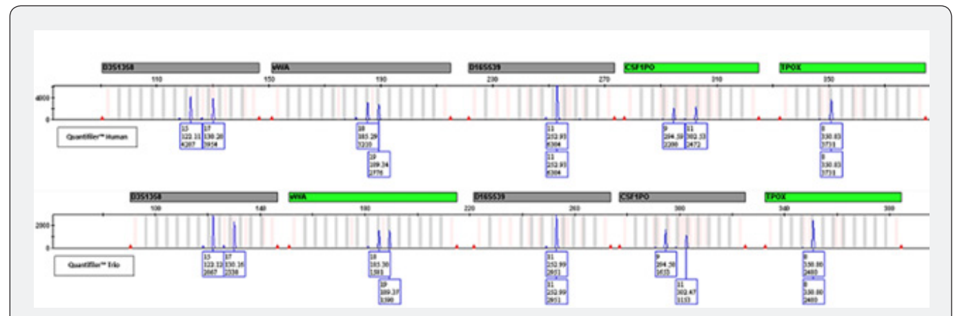
FIGURE 2: AN EXAMPLE OF THE ELECTROPHEROGRAMS OBTAINED BY THE QUANTIFILER™ HUMAN AND QUANTIFILER™ TRIO QUANTIFICATION KITS. THERE WAS A DIFFERENCE IN THE PEAK HEIGHT OF THE DNA PROFILES AT FIVE AUTOSOMAL STR LOCI (D3S1358, VWA, D16S539, CSF1PO, TPOX).

However, different volumes were required for one sample (circled in Figure 1), for which, 9.5 \mu L of the sample was diluted with 5.5 \mu L of molecular grade water for the Quantifiler Human kit and 8.6 \mu L of the sample was diluted with 6.4 \mu L of molecular grade water for the Quantifiler Trio kit. Full DNA profiles were obtained by both kits, but the peak heights (RFU) produced using the Quantifiler Human kit were relatively higher than the peaks obtained by the Quantifiler Trio kit (Figure 2). However, this small difference may be related to a human pipetting error or using an uncalibrated pipette, therefore establishing regular calibration protocols (e.g., every 3 months) or considering automated solutions to process samples for quantification can be beneficial.