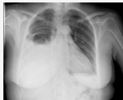
Figure 1: Increased cardiothoracic index and right pleural effusion with passive atelectasis of the right and middle lobes.

Physical examination shows hypophonesis in the right lung base, increased consistency at the lower right quadrant of the abdomen and edema with fovea in both lower limbs. The radiograph shows: Increased cardiothoracic index and right pleural effusion with passive atelectasis of the right and middle lobes [2-5] (Figure 1&2).