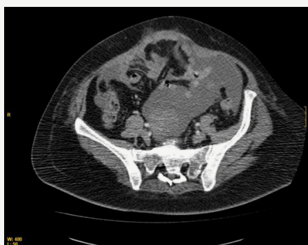
Figure 3: ovarian dependent mass suggestive of ovarian neoplasm and loculated ascites.

It enters and initiates treatment with diuretics with good initial response, improving the edema of lower limbs, although the pleural effusion persists. Together with the discrete alteration of acute phase reactants, it is possible to suspect a different etiology from heart failure. Evacuation thoracentesis was performed with 4000cc of exudate-type pleural fluid, with subsequent relapse in the left hemitorax.