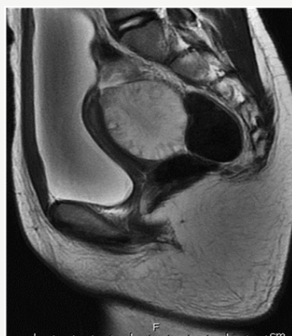
Figure 2: MRI finding at First onset. Fat-suppressed T2-weighted image shows the markedly high intensity right ovary enlarged 8cm, with peripherally displaced follicles