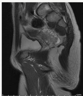
Figure 1: MRI finding at First onset. Fat-suppressed T2-weighted image shows the markedly high intensity right ovary enlarged 4cm, with peripherally displaced follicles.

was performed. After untwisting, the color of the ovary promptly returned to white and pink. The right ovary was fixing the ovary to the broad ligament, as the ligament was extended and the risk of re-twisting was high (Figure 4). The postoperative period was uneventful. On the fifth postoperative day, ultrasonography revealed shrinkage of the right ovarian diameter to 6cm. She was discharged on the sixth postoperative day. Histopathological findings showed noneoplastic change, but presence of MOE. At 5 months post-surgery, no recurrence was seen, and the ovaries were real most normal size.