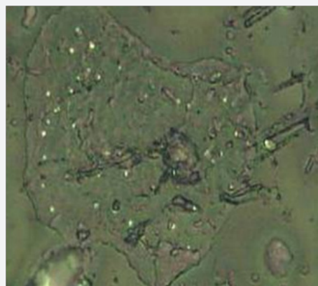
Figure 2: Damaged epithelial cells with diagnosis cervical cancer.

index is higher than that of the surrounding cytoplasm because of their chromatin content.