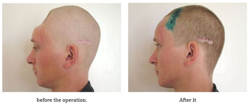
Figure 2: demonstrate the Litar application in the restored bone tissue.