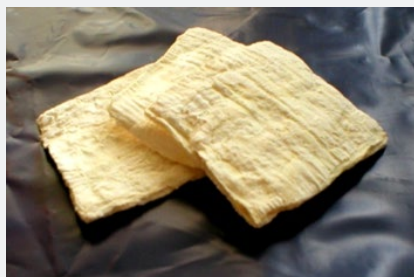
Figure 1: Lit Ar implantation material.