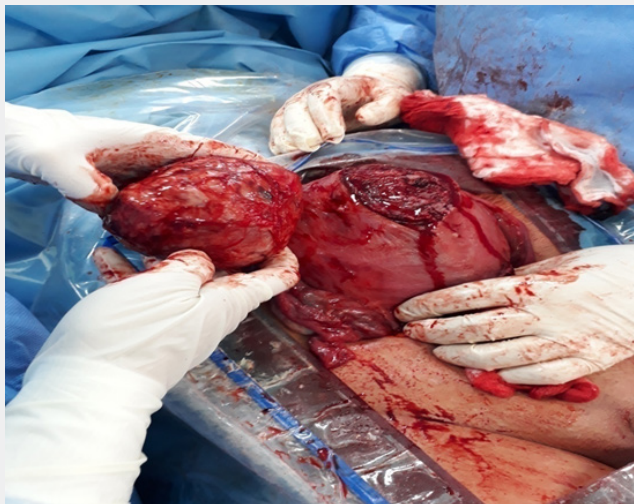
Figure 2: Uterus after removal of myoma mass during cesarean myomectomy. A longitudinal incisions were made over the surface of the myoma. After reaching the surface of myoma, edges were freed using sharp dissection then myoma was extracted.

were done using two layers of interrupted absorbable sutures (1-0 vicryl) then the serosa was sutured, using a continuous absorbable suture (2- 0 vicryl), as a third layer (Figure 3).