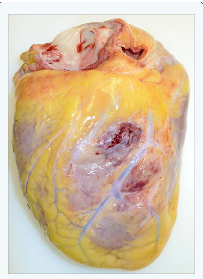
Figure 2: Rupture of the left ventricle as a complication of a transmural myocardial infarction.