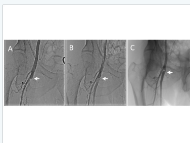
Figure 1: Angiographic images of the right femoral artery, before, just after and one year after endovascular therapy (EVT) with balloon dilatation.

A 66-year-old man with hypertension and hyperuricemia was admitted to our hospital for effort-induced chest pain. Coronary angiography revealed severe stenosis in the proximal left anterior descending artery (LAD), and percutaneous coronary intervention (PCI) for an LAD lesion was performed after accessing the right femoral artery. The Ankle-brachial index (ABI) on the right side was 1.1 and on the left side was 1.15. Femoral artery diameter was 7.4 mm on the right side and there was no evidence of any stenosis. Prior to the procedure, he received aspirin (100 mg/day) and clopidogrel (75 mg/day) for seven days. A 7 Fr, 11 cm sheath was inserted into the right femoral artery. Sheath insertion was immediately followed by an intravenous injection of 5000 units of heparin. A drug-eluting stent (24 x 3.5mm) was deployed in the proximal LAD, and the puncture site was closed with an 8 Fr Angio-Seal™ device.