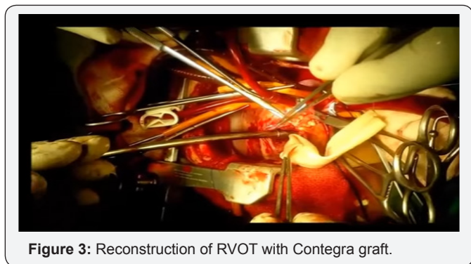
Figure 3: Reconstruction of RVOT with Contegra graft.

The patient was operated on 19 January, 2015. Under general anesthesia with endotracheal intubation and broad spectrum antibiotic coverage, standard median sternotomy and pericardiotomy was done to expose the heart. Cardiopulmonary bypass was established with bicaval cannulation and aortic cannulation. Heart was arrested with aortic root antegrade cardioplegia and mild hypothermia (32 °C) after application of cross-clamp. The subarterial VSD was approached through right ventriculotomy, RVOT muscle bands were resected, VSD was enlarged anteriorly and was repaired by a split-opened Dacron tube graft to produce intracardiac baffle, it reduced the right ventricular cavity size. The severely stenosed main pulmonary artery was resected, proximal end was closed with double