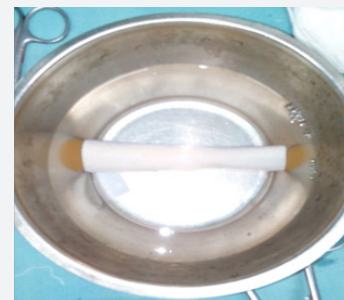
Figure 1: Contegra graft (processed bovine internal jugular vein).

The definitive management of DORV is always surgical. The contegra grafts are derived from bovine internal jugular vein with its trileaflet venous valve, preserved in buffered glutaraldehyde solution, available as 10-22mm size, are readily available from shelf for right ventricular outflow tract (RVOT) reconstruction where homografts or composite pulmonary conduits fail or are not easily available [3] (Figure 1).