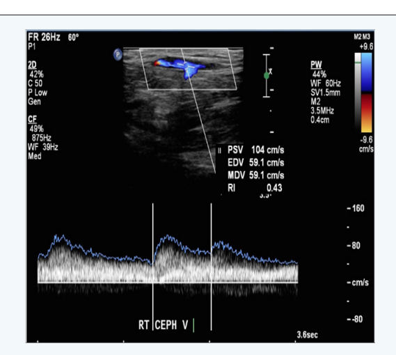
Figure 2: Arteriovenous fistula with low resistance arterialized waveform on color Doppler ultrasound.

Ultrasonography (Figure 1 & 2) demonstrated an arteriovenous fistula (AVF) between the right radial artery and the right cephalic vein, which demonstrated a low resistance arterialized waveform with a velocity of 143cm/s. He was managed conservatively as he was asymptomatic. When seen in follow up, his bruit was no longer heard on auscultation.