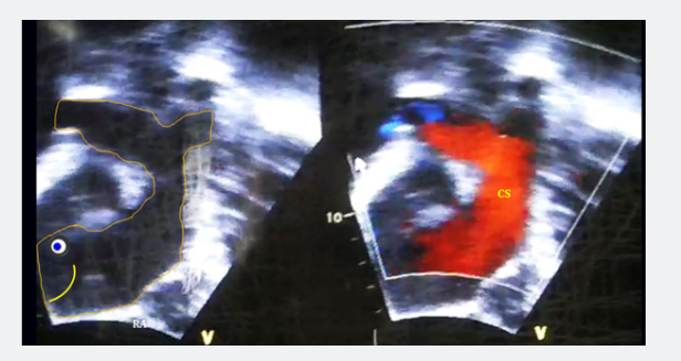
Figure 3: Subcostal view shows the classic image "whale's tail appearance", the coronary sinus is verticalized and filled completely by the flow of the pulmonary veins. CS: Coronary Sinus.

4. Colour Doppler image of the pulmonary venous collector draining to the coronary sinus ("whale's tail" appearance) (Figure 3)